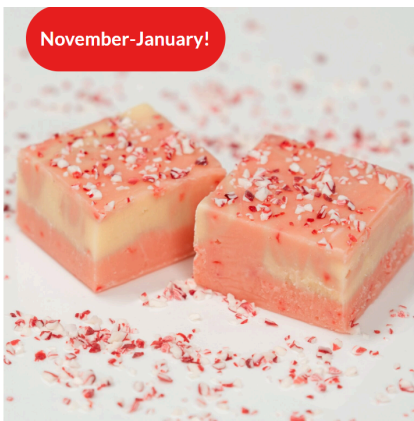
Candy Cane Fudge

We will be hosting a fudge tasting program with fudge from Valley Fudge & Candy. We will be sampling 6 different varieties of fudge. Some will even be reflecting the well known flavors associated with the holidays! This program will be held on January 9th @ 2:00 PM. This program was made possible by donations to our Recreation Therapy Department. Thank you, History Alive Project, for your generous donation!