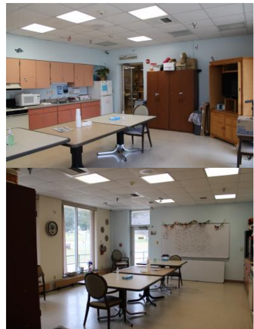
*Decorah Room Before Pictures

As part of our love lights fundraiser from December we will be working on upgrading our Decorah room this year. We would like to extend a huge thank you to everyone who participated in this fundraiser by donating in honor of their loved ones. These generous donation will allow us to give this communal space a fresh coat of paint, make improvements to the cabinetry and provide additional storage to our Recreation Therapy Department.